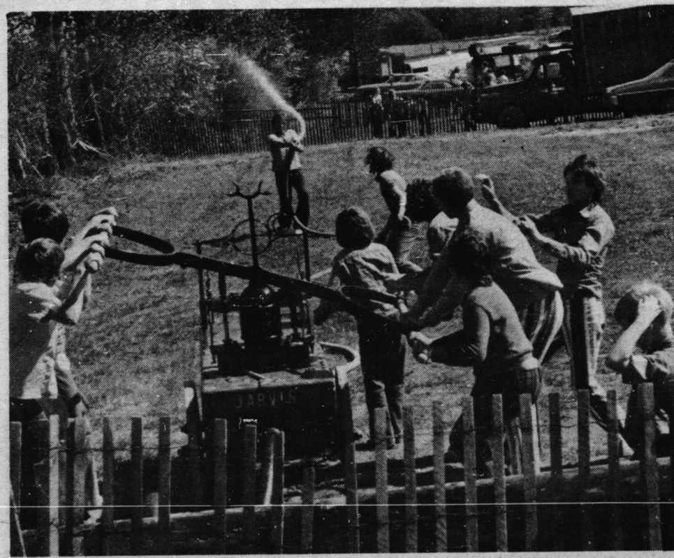
One way to keep cool Monday was to help man the old Jarvis Fire Department water pump and then get sprayed for your efforts.