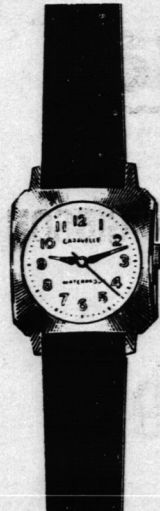
CARAVELLE MODEL 4800T is yellow. Combination numerals and markers on radial brushed silver finish dial. Unbreakable main-spring. Red sweep second hand, red strap. $24.95

It is not too early to choose that special WATCH