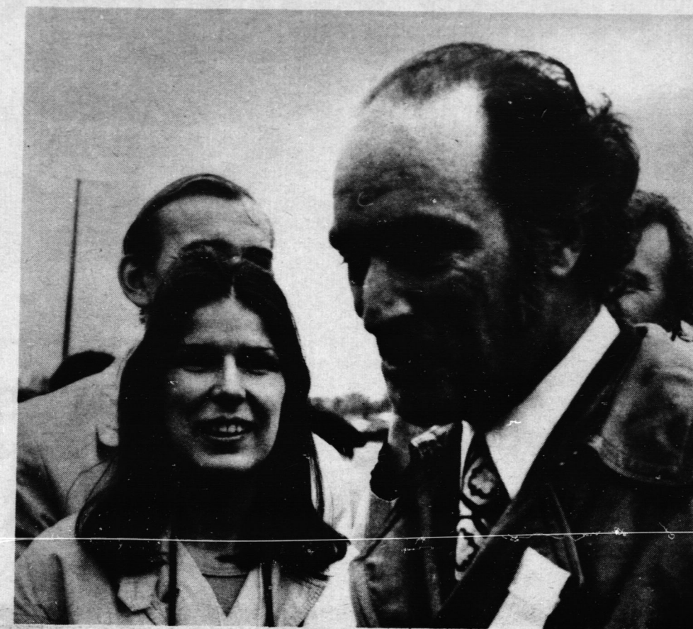
Prime Minister Trudeau smiles as he moves through the crowd at the Norfolk County Fair on Saturday. His visit to the fair was part of a whirlwind tour through Haldimand and Norfolk counties.