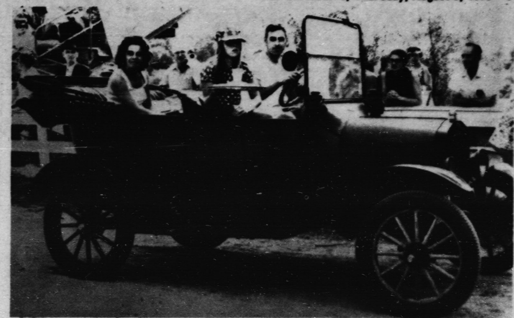
You had to have a steady hand for this race in Caledonia on the week-end. The object was to keep from spilling the glass of water while the car moved down the track. (Staff Photo)

TRAVEL REPORTER Even "down under" you're still on top with Featherstone travel service! FEATHERSTONE TRAVEL LIMITED 29 Talbot St. N. Simcoe Phone 426-4015