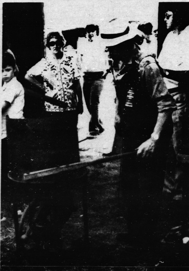
The blacksmith shop at Caledonia's Golden Horseshoe City is pictured here.