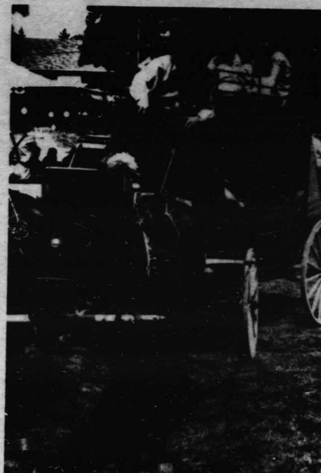
Children enjoyed stage coach rides on the Gunsmoke Express in Caledonia Sunday.

Help the Mentally Retarded TODAY - volunteer - give a donation - learn more about mental retardation Contact your local association