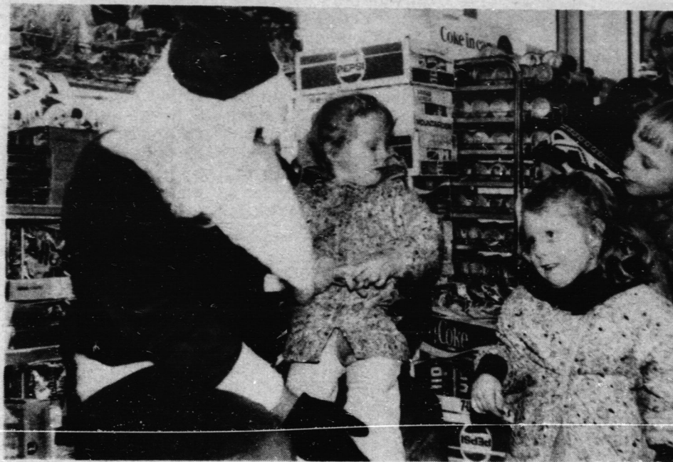
One of the highlights in Jarvis Saturday was Santa Claus' visit to the A & M Market.