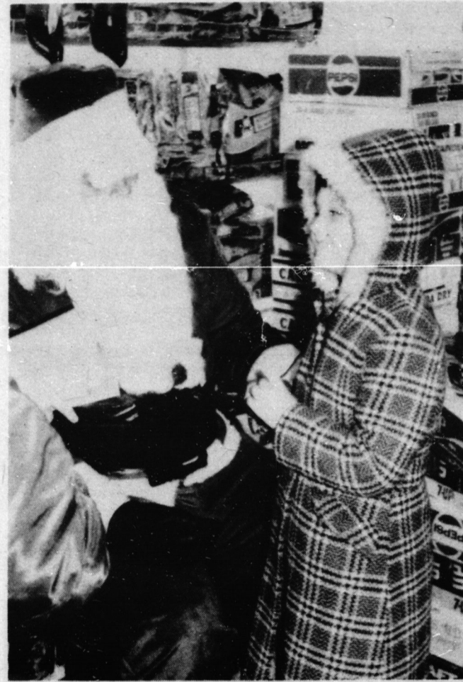
Santa Claus gets a bright smile.

appreciation for the mufflers when the Cayuga Track Announcer asked for it at a race last season. The crowd gave a 100% backing. One fan said that with the mufflers, new sounds can be heard. The squeal of tires and the howling transmissions add a new and exciting dimension to the sounds of racing.