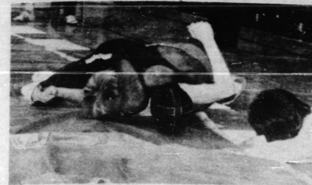
Wrestling spectators and participants filled the gym of Hagersville High last Saturday morning for a special "Invitational Meet."

STORE HOURS STORE CLOSED WED. AFTERNOON OPEN THURS. & FRI to 9 P.M.