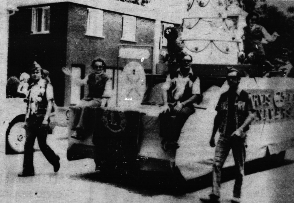
The Jarvis Lions' Club entered their anniversary float in Hagersville's Dominion Day parade on July 2nd.

Their antique-art shop blends the new with the old; glassware, See Page 6, Col. 3