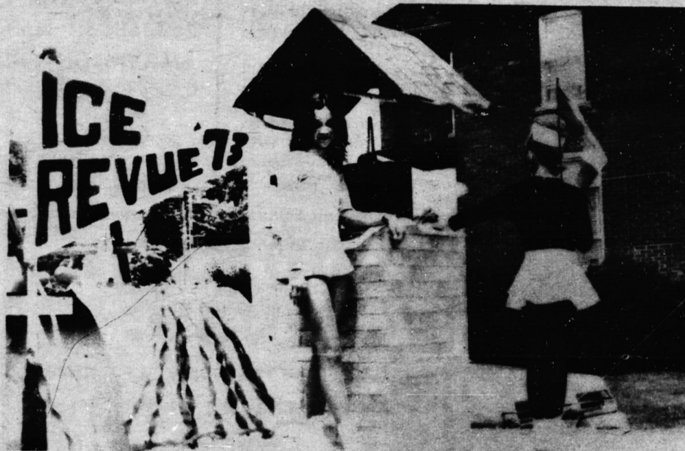
Ice Revue '73 skated away with a prize in Monday's parade in Hagersville.