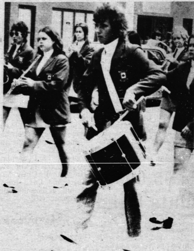
Members of the Hagersville Secondary School Band participated in the July 2nd parade.