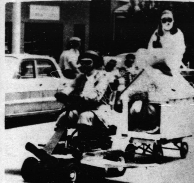
Somebody was in the dog house on July 2nd.