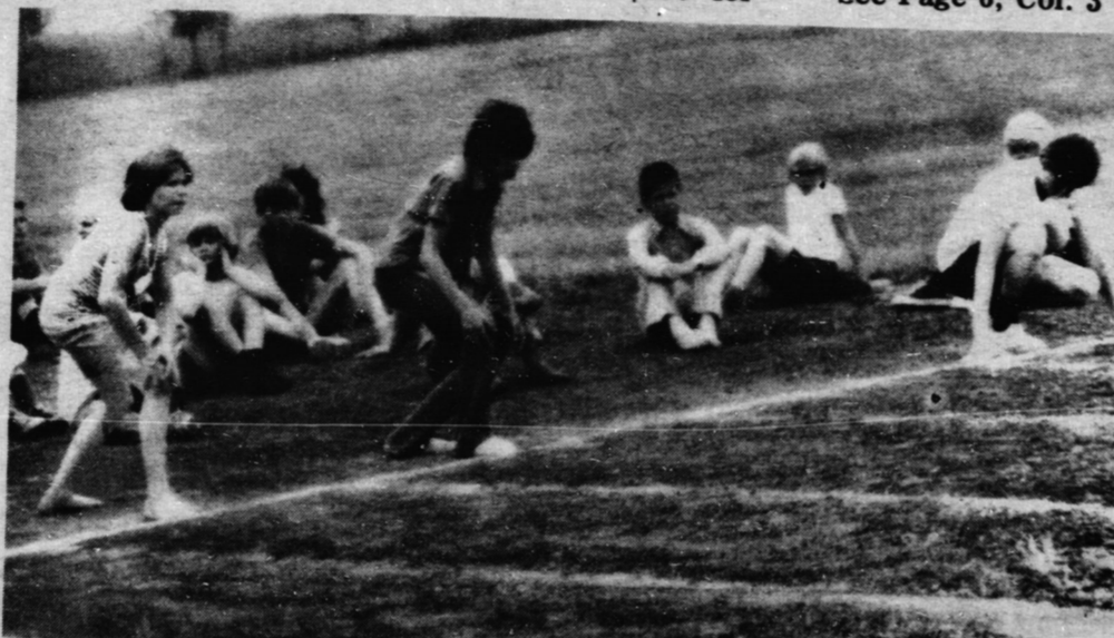
Students from Jarvis, Parkview, Northview, Walpole North and other area public schools participated in a track and field meet at H.S.S. Monday.