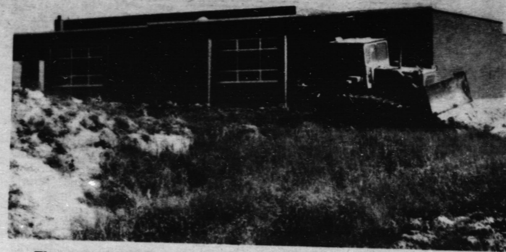
The new addition being built on Parkview Public School in Hagersville is almost completed. At last week's Board of Education meeting, the property committee reported that this new section should be ready for occupancy by September 5th.