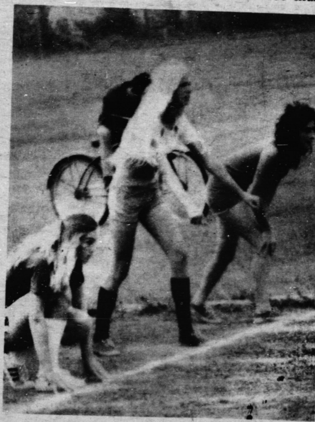
Three girls are set to run the dash at a public school track meet at H.S.S. (Staff Photo)