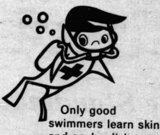
Only good swimmers learn skin and scuba diving.