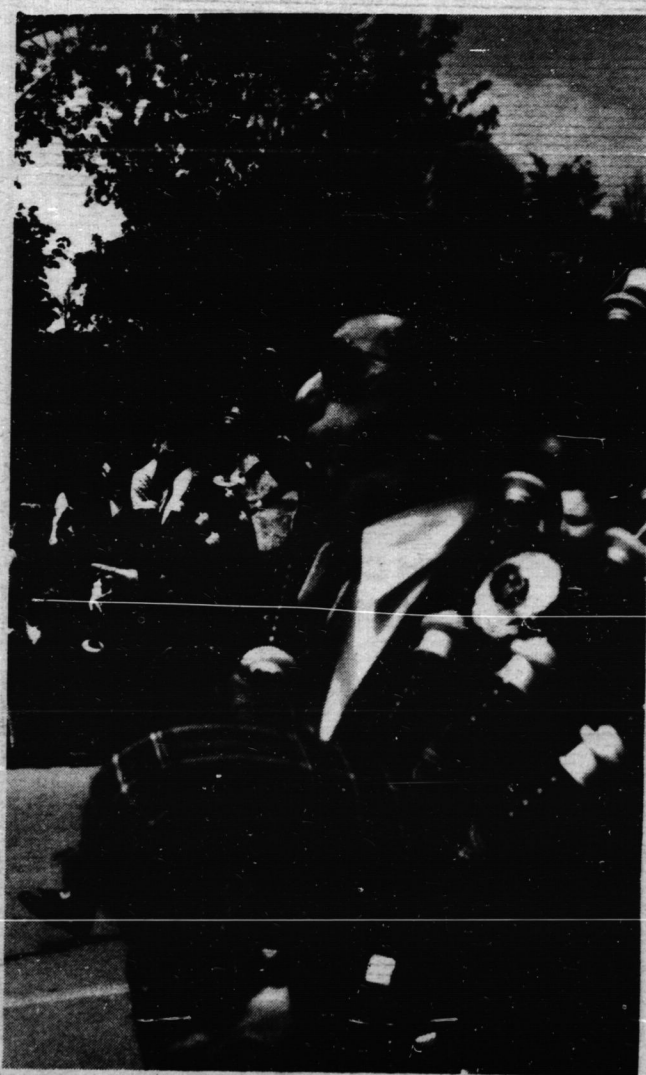
Bagpiper in Jarvis' Calathumpian parade. (Staff Photos - M.L.W.)