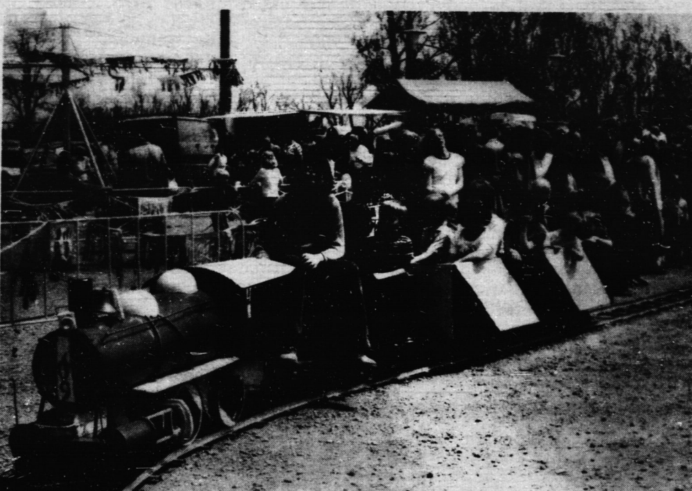
Rides in the park on May 21st.

Sunny skies and warm weather greeted crowds estimated at between 5,000 and 6,000 who jammed into Jarvis for the annual Victoria Day celebration and Calathumpian Parade.