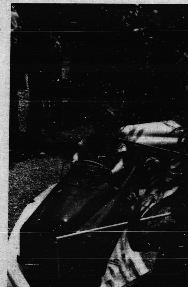
Little children were kept occupied on rides during Jarvis' Victoria Day celebrations.