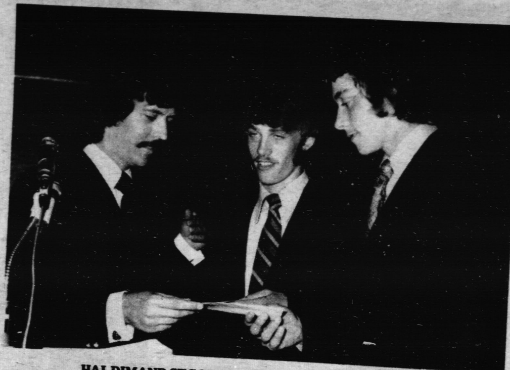
HALDIMAND SECOND IN JUNIOR TEAM PLOWING