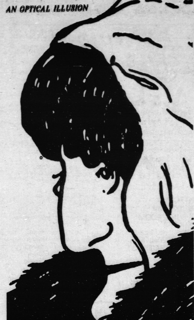
Look closely at this picture. What do you see? An old hag or a pretty young woman with her head turned away? Keep looking and you should eventually be able to see both without too much trouble, but don't worry if it takes you a long time.