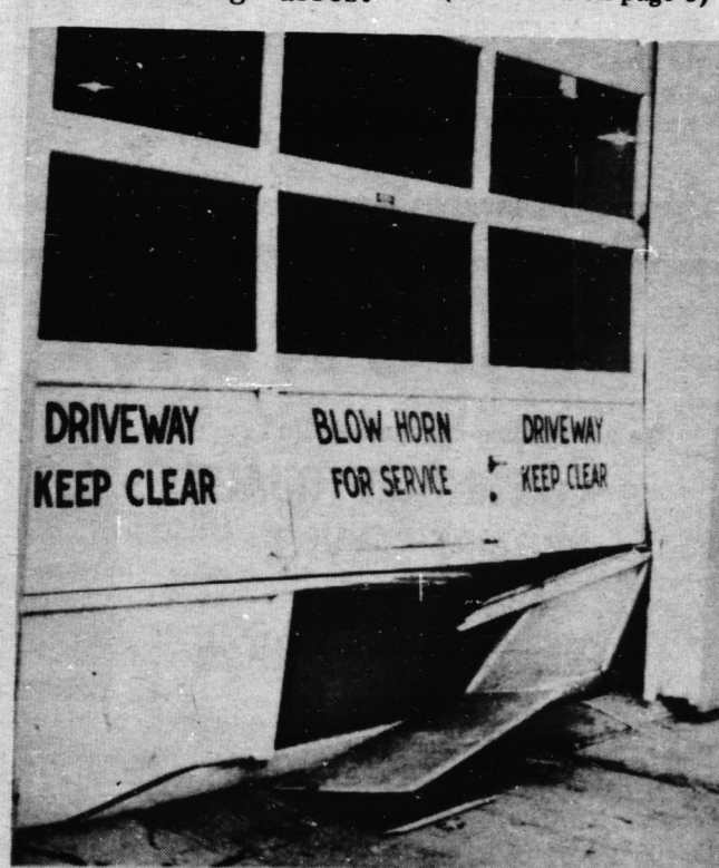
A youth attempted to back out of Webb Motors early Friday morning damaging the large garage bay doors. (Staff Photo)