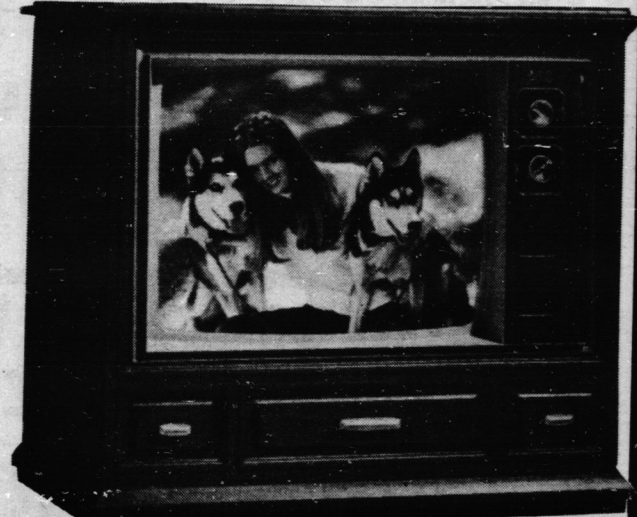
26" Zenith Solid-State Chromacolor II