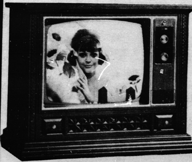
25" Zenith Solid-State Chromacolor II

MODELS ADVERTISED IN STOCK FOR IMMEDIATE DELIVERY