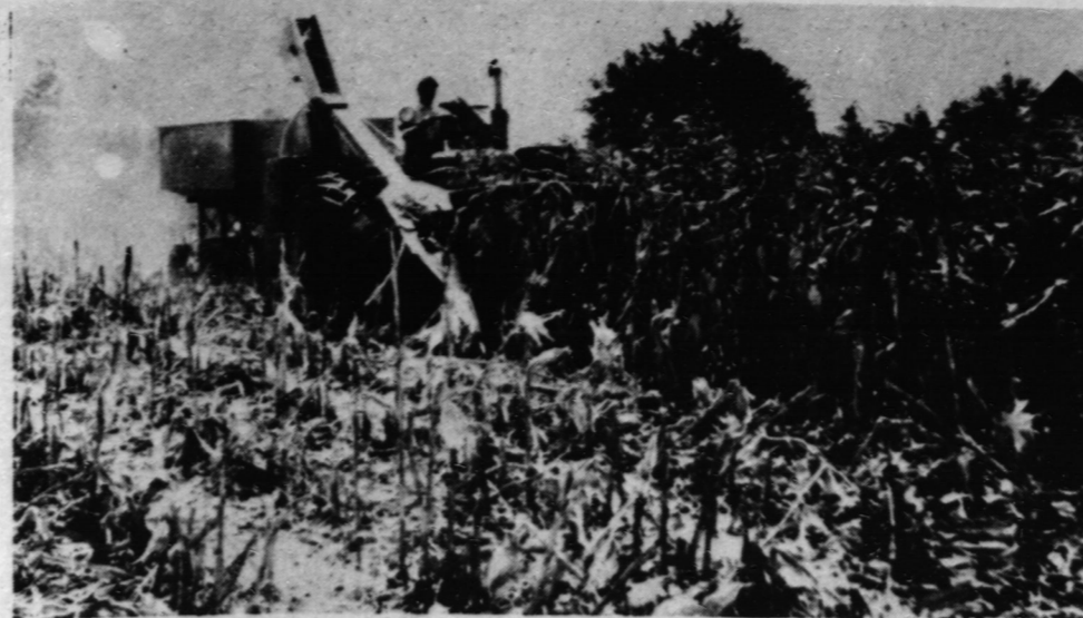
Farmers began harvesting corn earlier this year because of the dry weather. (Staff Photo)