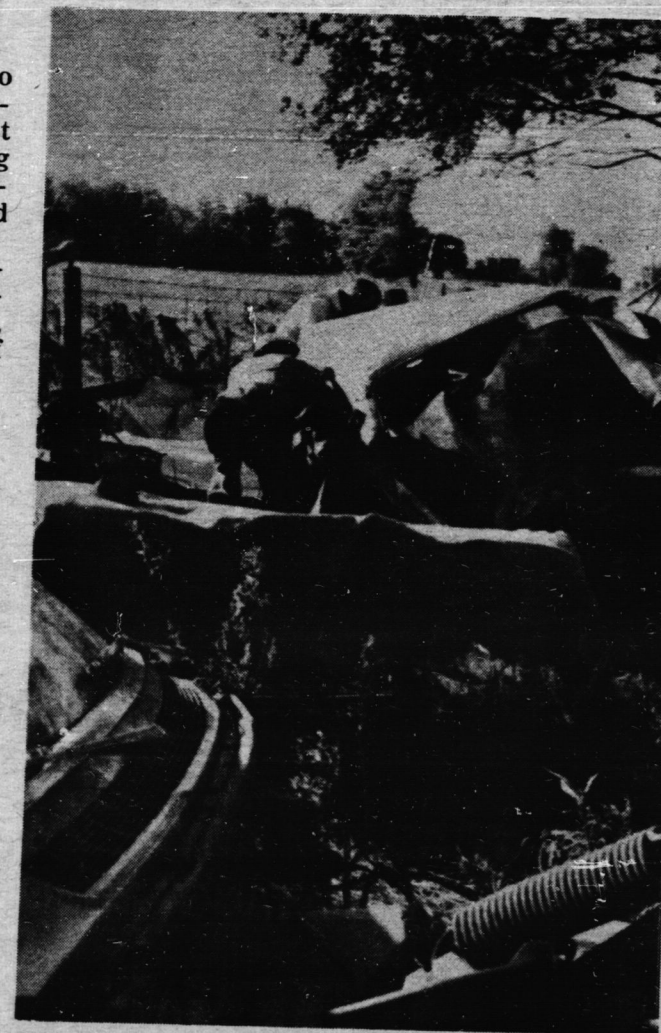
Three persons who were killed in this two car collision on the Nanticoke Sideroad last Wednesday have been identified.