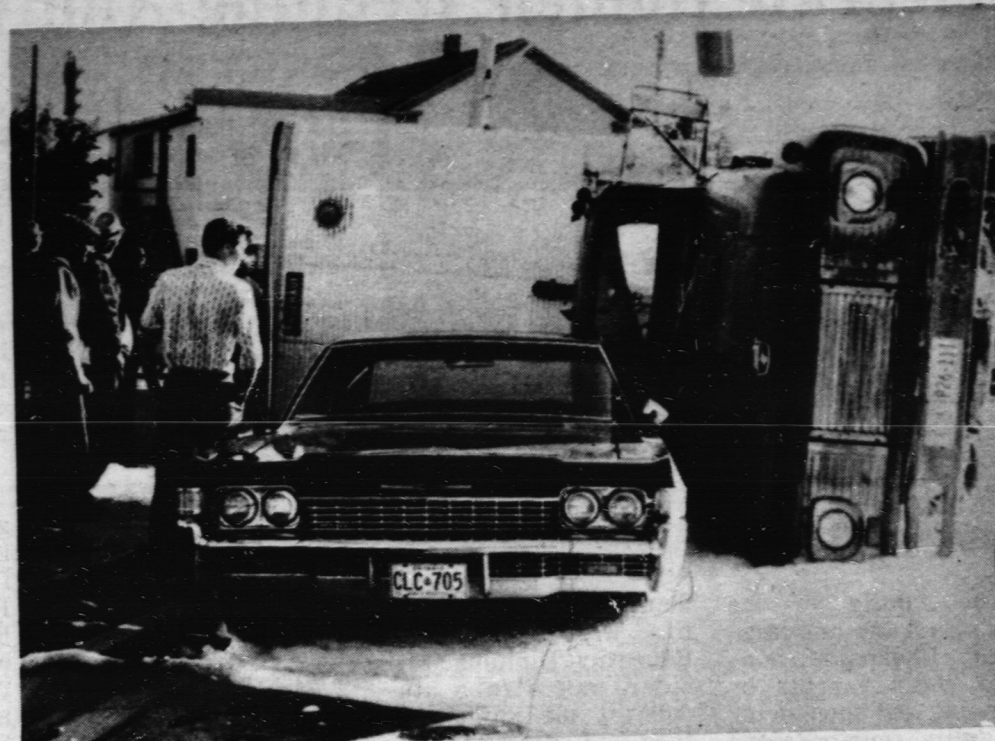
A tractor-trailer which flipped at the corner of Highways 3 and 6 in Jarvis last Thursday caused $500 damage to the Klaas Druyff car.

Ward 1 - Concession 1 in the Townships of Walpole and Woodhouse, and those portions of Con. 2 of Walpole, north of the Rainham Road and those portions of Con. 2 in the Township of Woodhouse, north of County Road 6, which traditionally forms a community in the lakeshore area (eg. the Village of Nanticoke, which lies on both sides of the Rainham Road and should not be divided) and including those portions of Woodhouse (continued on page 6)