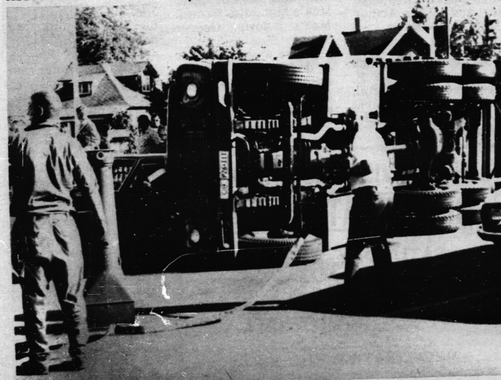
Members of the Jarvis Fire Department prepared to hose the overturned tractor-trailer last Thursday.