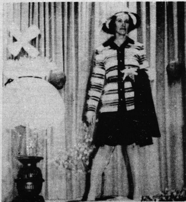
Fashions for Spring '74 was a big success with Jarvis and area women last Wednesday.

No one colour predominated the Jarvis show, but pastels, melon and off-white (oyster, (continued on page 5)