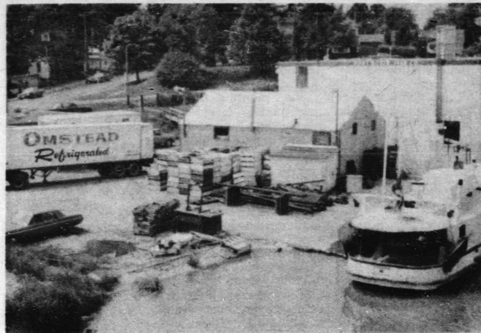
AT PORT DOVER - A fish tug docks at a processing plant as a refrigerated trailer - truck waits for a load of fish. (staff photo)