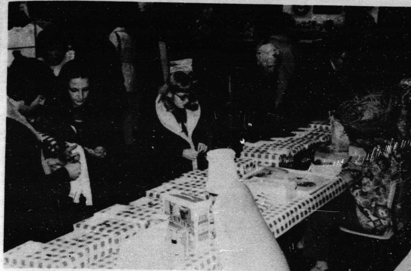
Crowds of people helped make the H.S.S. Band Bazaar a success Saturday.