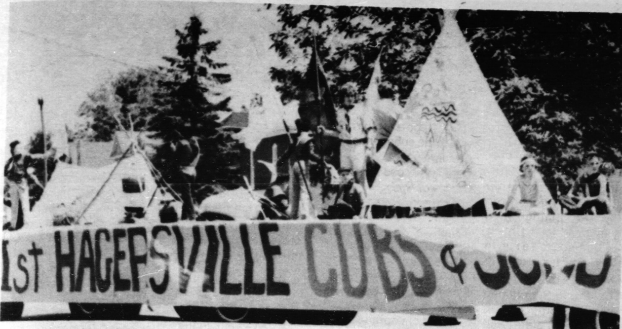
July 1st celebrations in Hagersville.