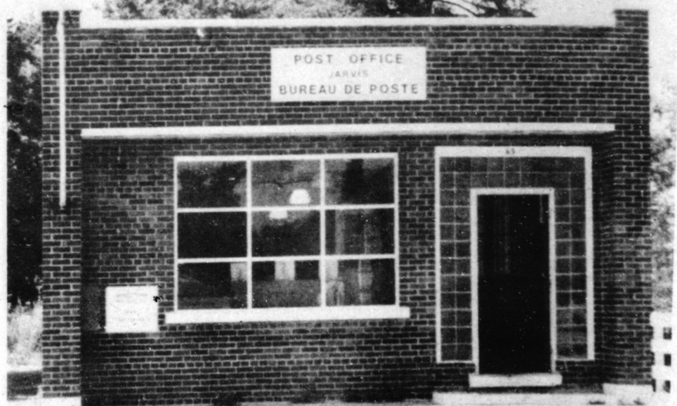
Jarvis Postmaster Larry Scarr will hopefully be moving from the present office to a new building by June of 1975.