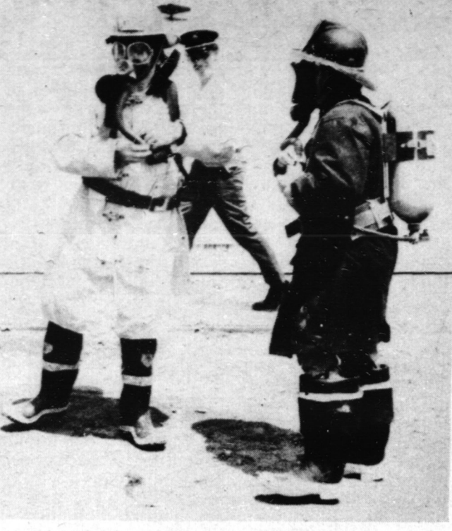
No, these aren't men from outer space. They are firefighters learning new methods at the Fire School in Port Rowan which the Jarvis firemen attended.