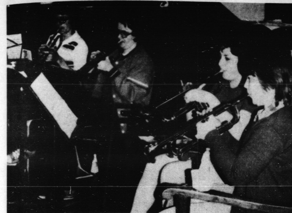
The Hagersville School Band played 30 hours in a Band Marathon last Wednesday and Thursday beating the previous record set by Ancaster of 27 hours.

Don't miss regular FRIDAY NIGHTS at 8:30 p.m.