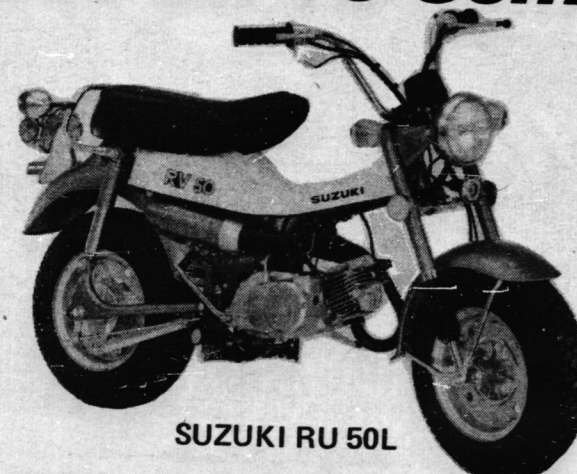
SUZUKI RU 50L

Weights 165 lbs., low pressure 5:40x10 tires, 4 speed transmission, cruising 35 - 40 m.p.h. Comes with tire pump. A perfect bike "to start", only $459.