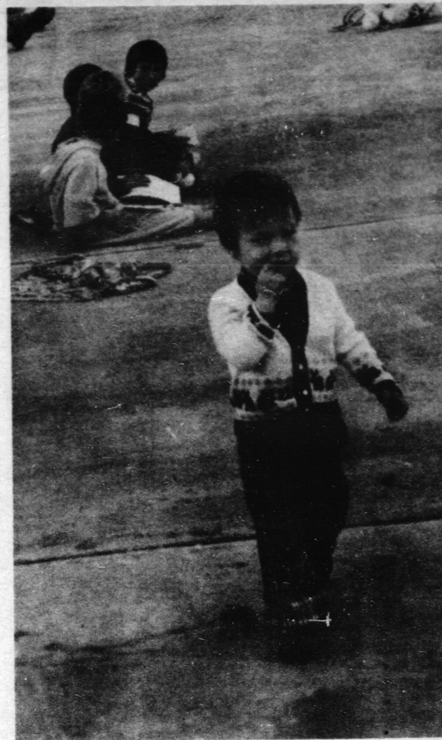
This little fellow had enough of the Hagersville Pool demonstration.