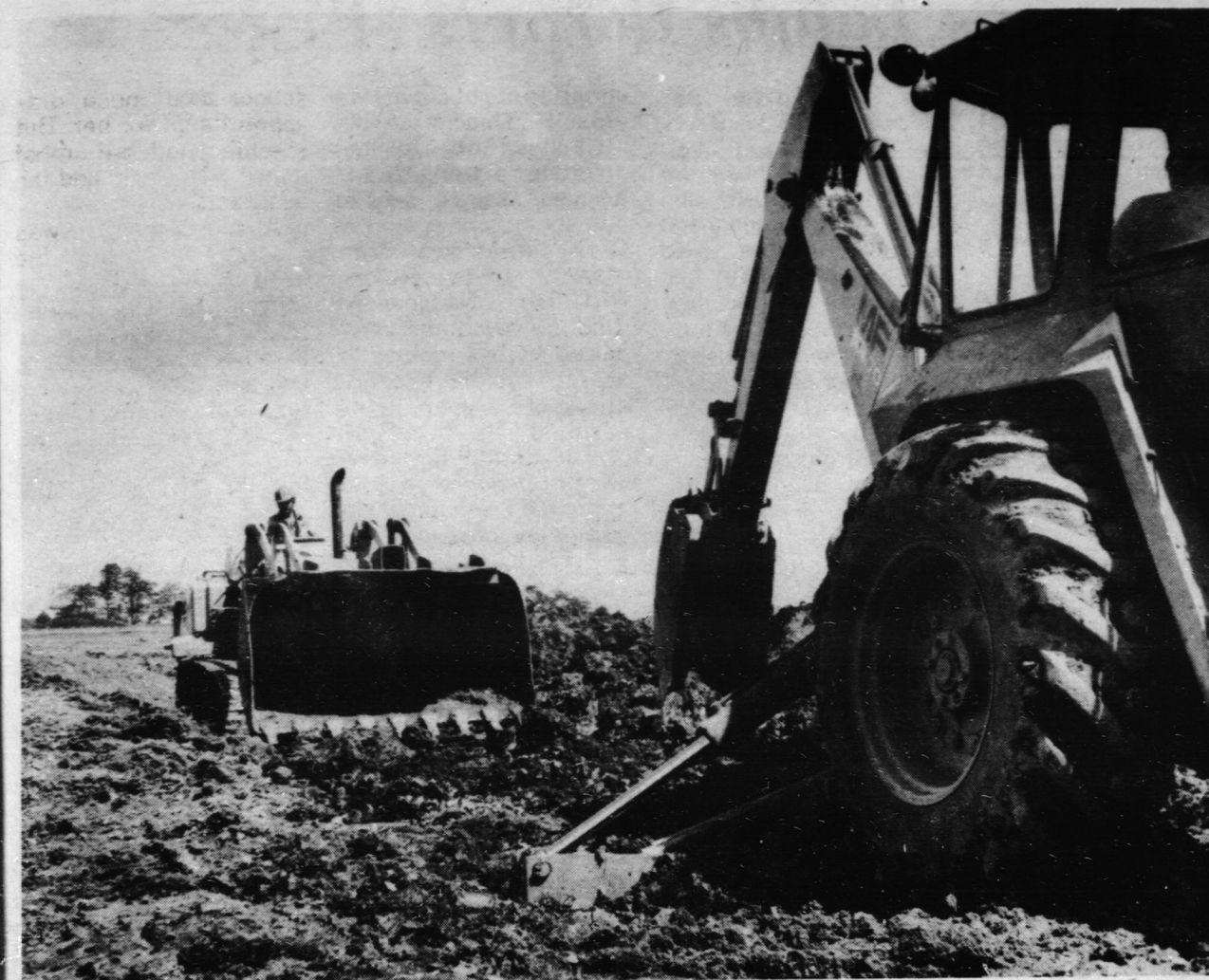
Bulldozer and backhoe remove drainage system from the perimeter of the old airport

W.J. ELLIOTT & SON LTD. 587-2281 - JARVIS