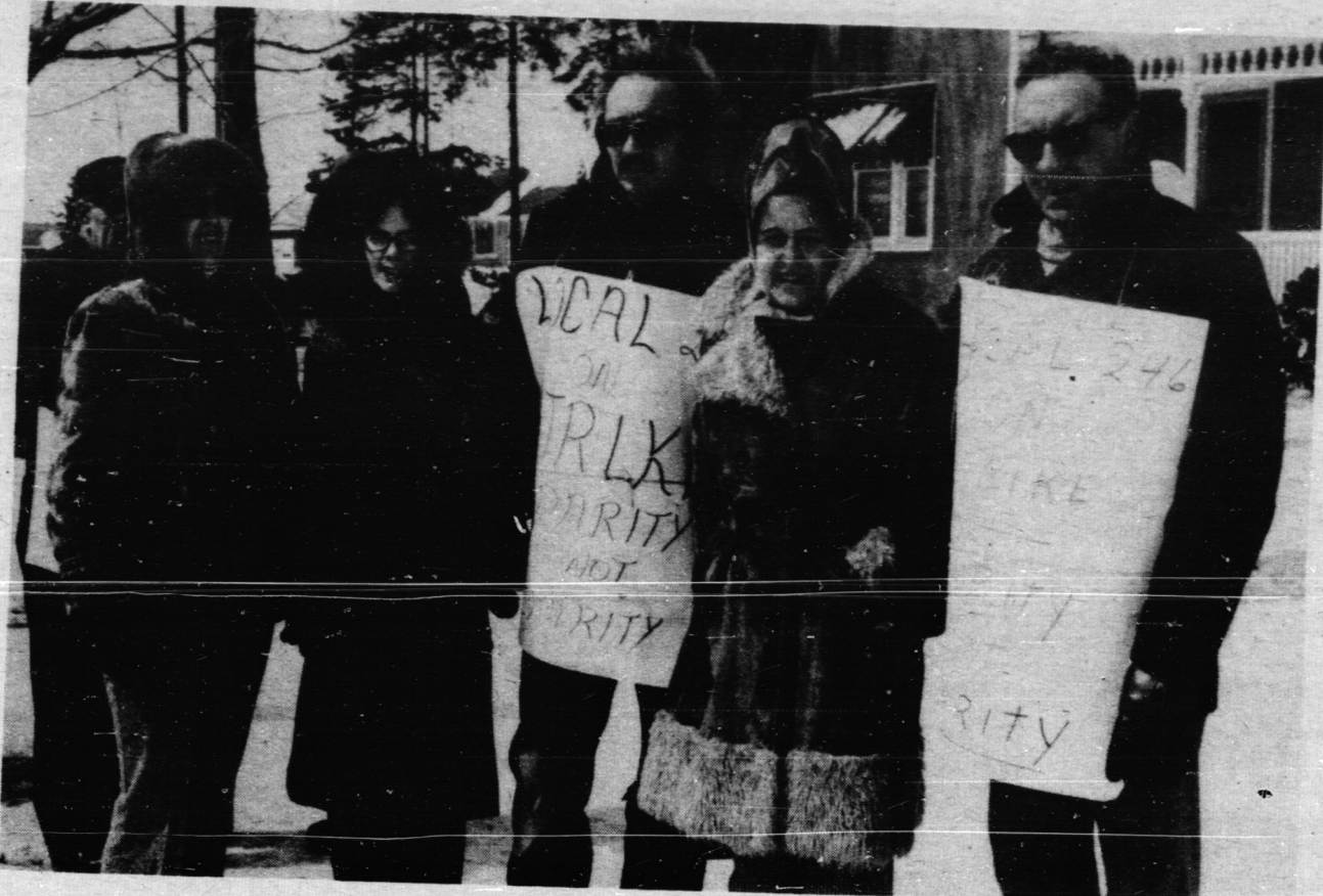
Wives walked the picket line at Langton arena with their husbands on Saturday.