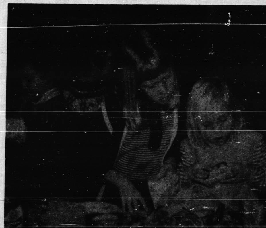
These girls can't seem to be able to decide between ham and cheese, and peanut butter and jam, while the young man in the background couldn't wait for popcorn.