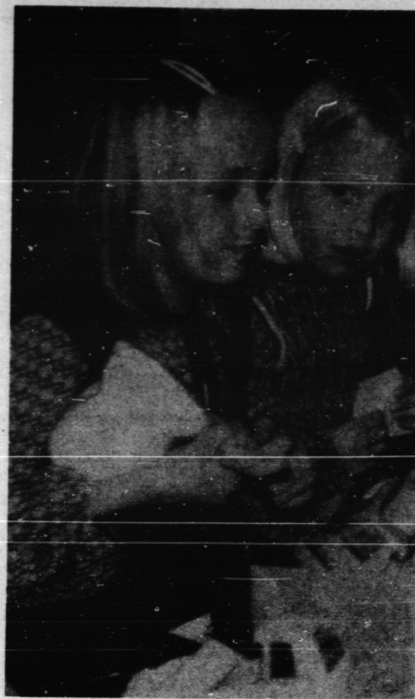
These two young ladies appear anxious to get a bargain at the White Elephant Table.