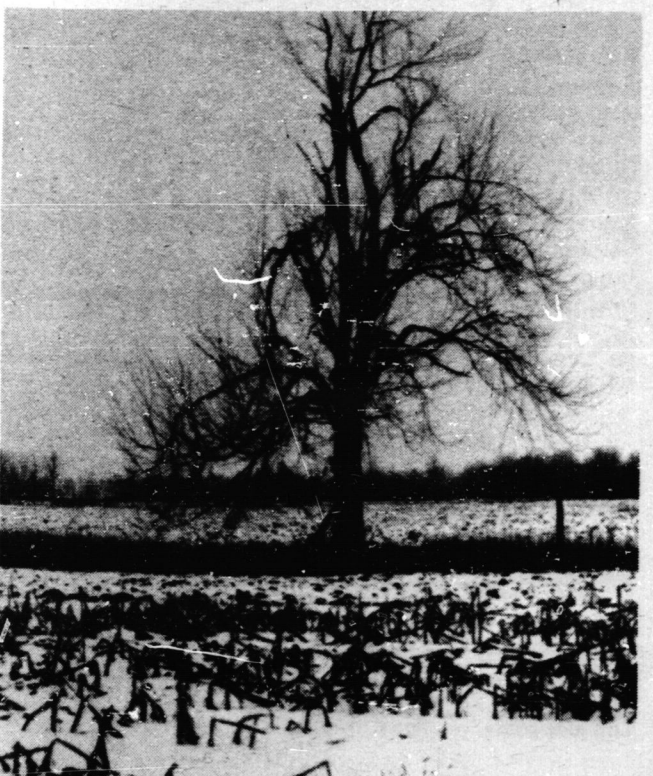
Winter Stubble..