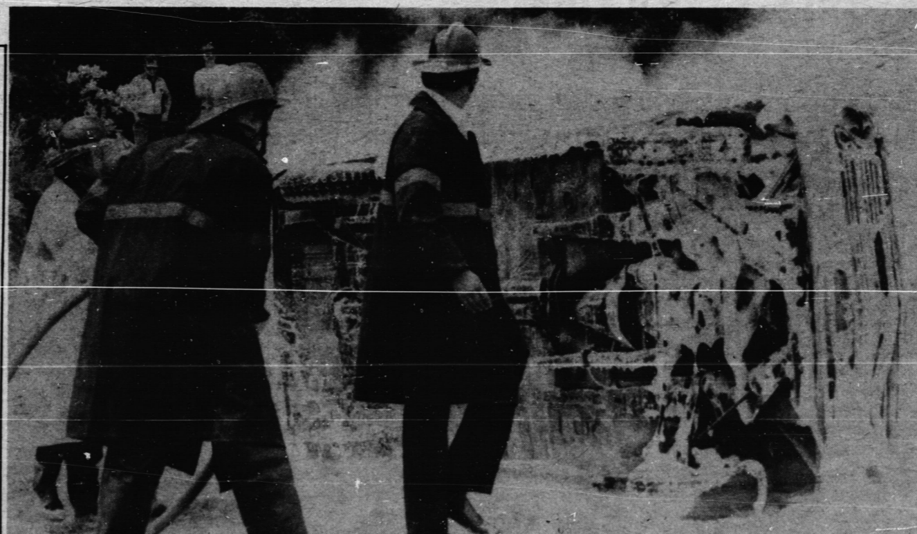
During a practice drill held in Waterford on Sunday, firefighters apply foam to a car that instructors set ablaze with gasoline.