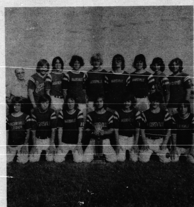
The Midget team won the tournament championships in Paris.