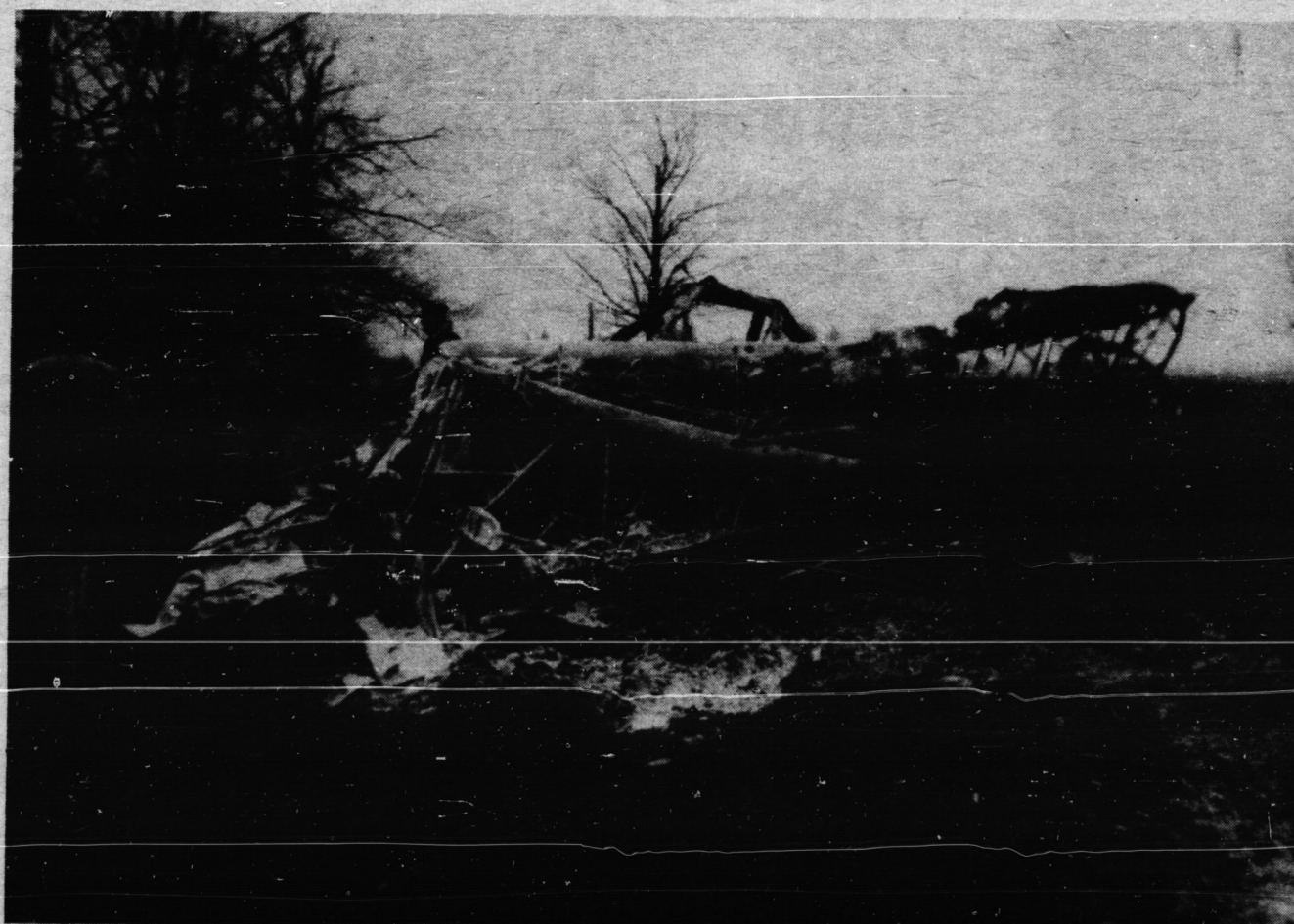
This is the remains of an aeroplane that crashed in a field near Hagersville in which a Delhi man was severely burned last Thursday.