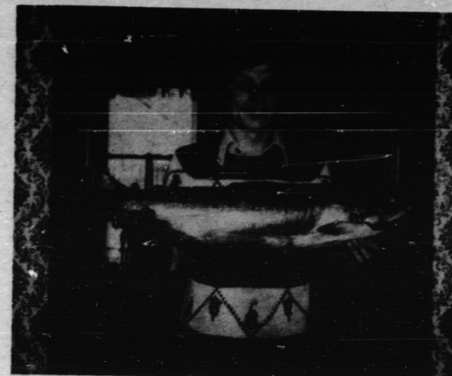
Not All The Big Ones Get Away

High Single - Ruth Phillips 319; High Triple - Ruth Phillips 697; High Average - Diane Blundell 214.