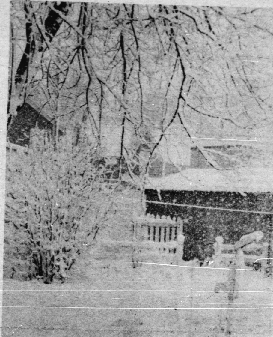
This wintry scene is a sure sign that balmy days are gone.