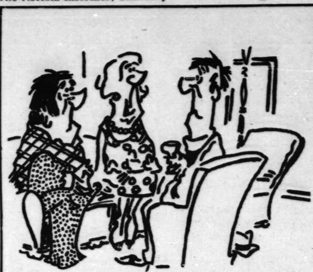
'Granny Isn't Staring at you - it's just that you're sitting where the Television Used to Be!'