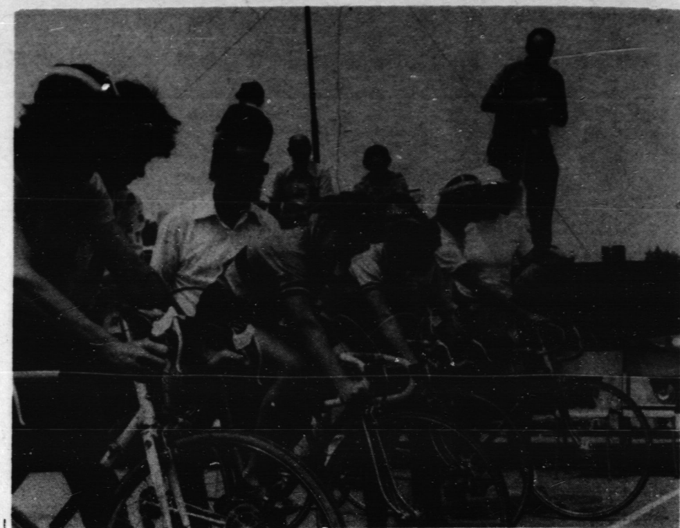
On your mark, get set: the tension is visible on their faces as a group of cyclists get ready for the start of a bicycle race in Delhi last Friday. The races were part of Belgian Days.

406 Townline Rd., Tillsonburg PHONE 842-8545