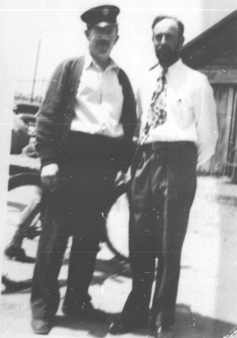
T. J. J. J.