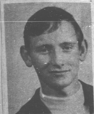
Among the five area students named to the Dean's Honor Lists, achieving consistently high academic standing at the recent Mohawk