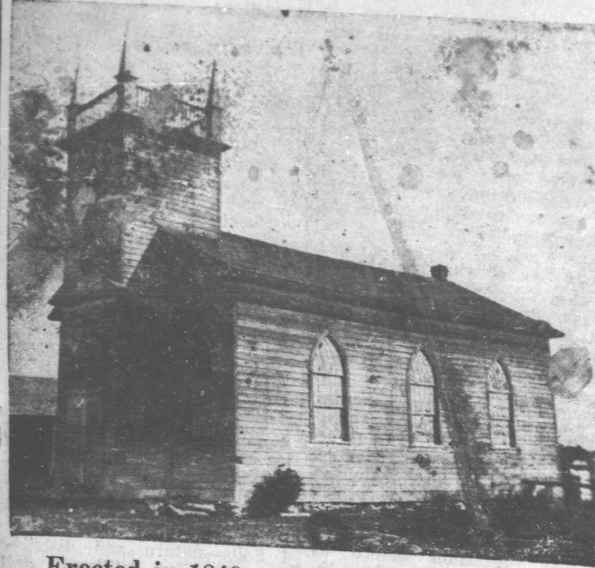
Erected in 1846 and Consecrated in 1860